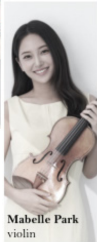
Mabelle Park violin